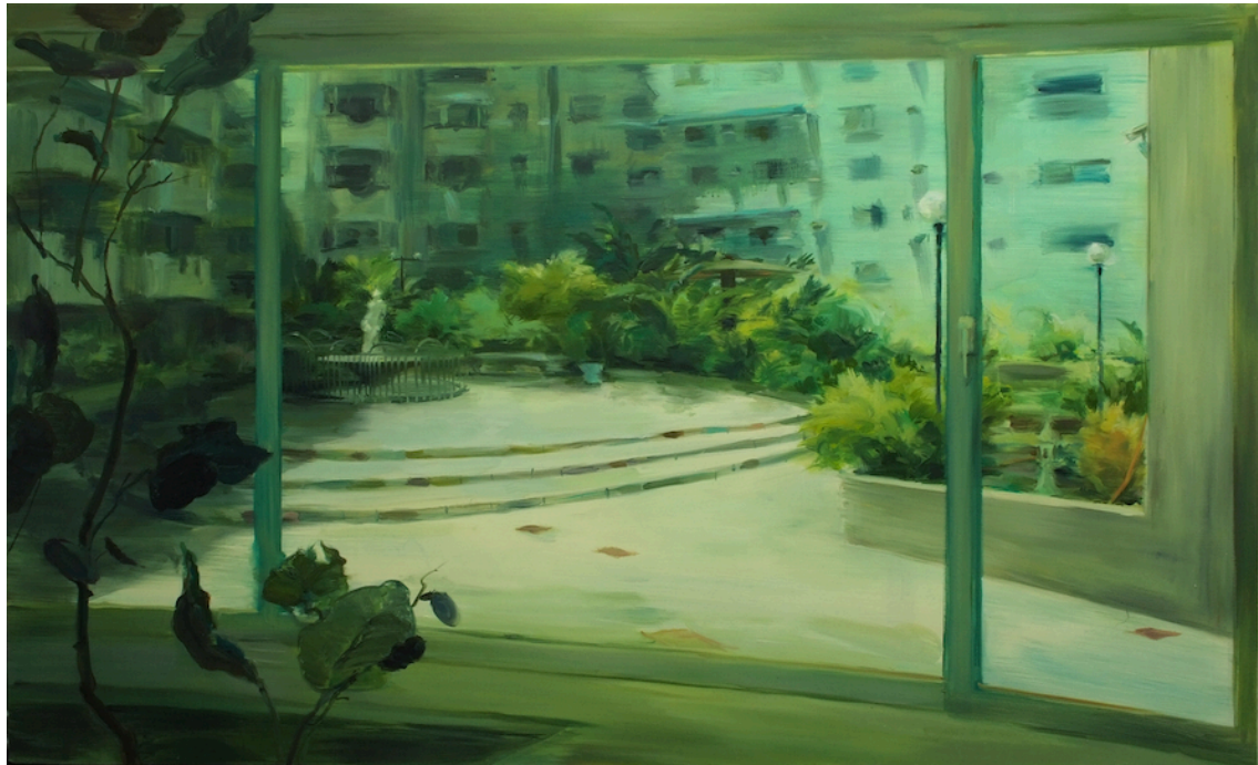
鄒享想 Tsou Hsiang Hsiang 《No.6》2017, 油彩、畫布 oil on canvas, 145.5x89cm