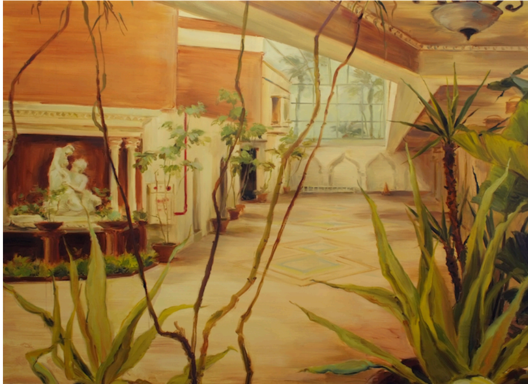
鄒享想 Tsou Hsiang Hsiang 《No.37》2017, 油彩、畫布 oil on canvas, 170x145cm