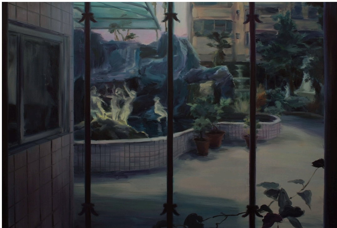
鄒享想 Tsou Hsiang Hsiang 《No.135-1》2017, 油彩、畫布 oil on canvas, 145.5x97cm